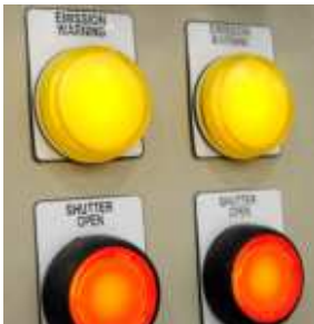
buttons and indicator lights