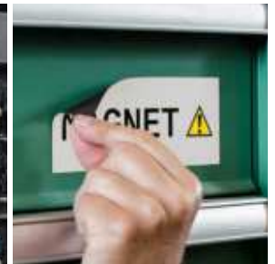
temporary magnetic signage

* Images taken of Brady products at a trusted operator's data centre