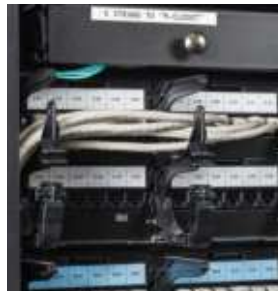
punch block labels