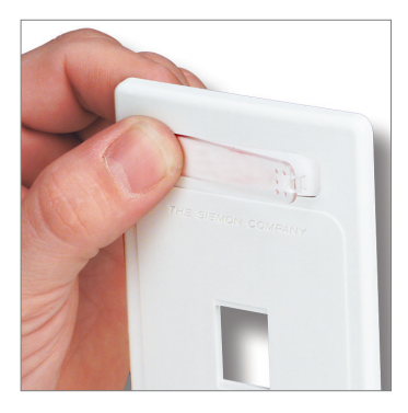
Labelling Most faceplates include pressure-release designation label covers for quick, tool-less removal.

Installation Flexibility Hybrid Z-MAX/UltraMAX or TERA outlets can be installed from the front or rear of MAX or 10G MAX faceplates.